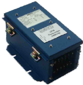
A800390 GF Detection Transmitter