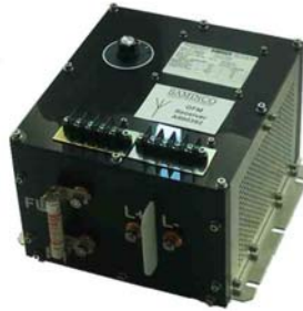
A800392 GF Detection Receiver