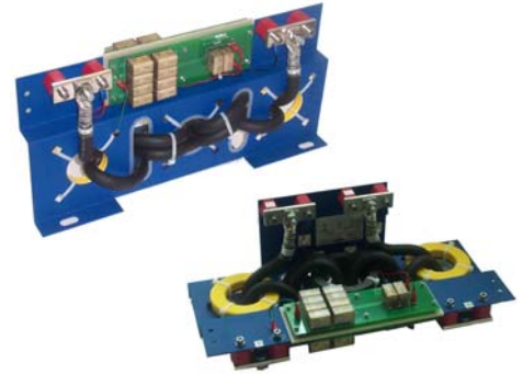
A800393 EMC Filter