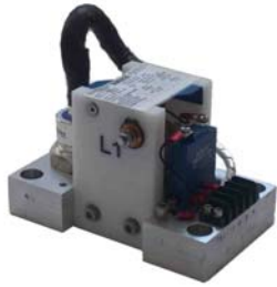
A800203 Ground Fault Detection Diode Assembly