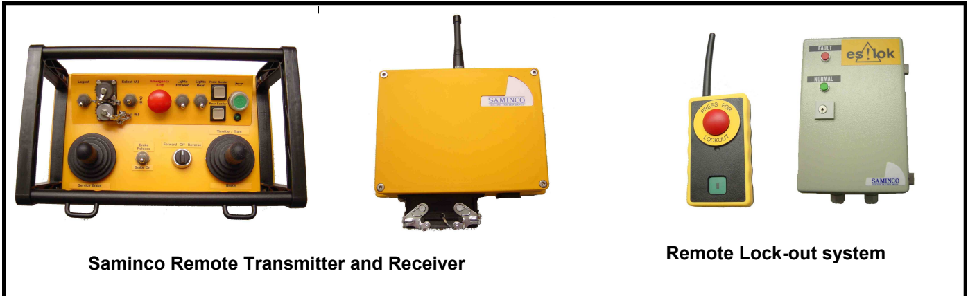
Saminco Remote Transmitter and Receiver